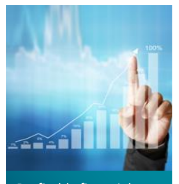
Profitable financial model with earnings growth and strong cash flow