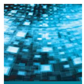
Technology leadership enables customers' most critical roadmap advancements, from R&D through Production