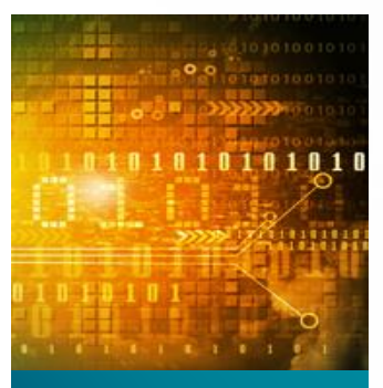
Active execution of acquisition strategy increases scale and diversification